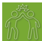
CHARACTER & LEADERSHIP

Through the Character & Leadership program Club members develop leadership skills and gain opportunities for planning, decision-making, contributing to our Clubs and community. We inspire our members and give them the confidence to make meaningful change in their communities, develop a sense of civic responsibility, and prepare for the future.